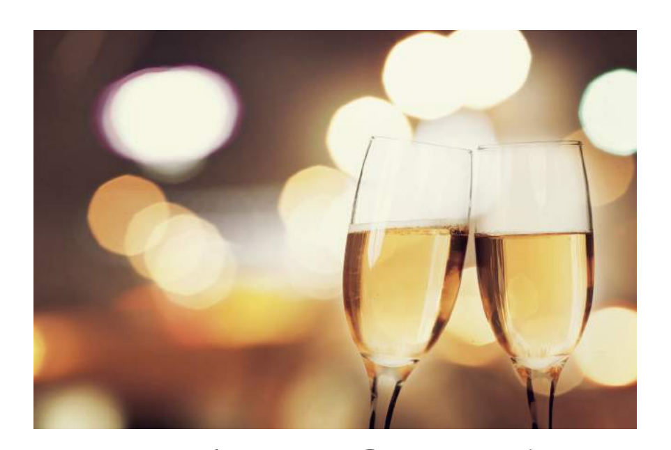
20th Annual Circle of Hope A Pennsylvania Women Work virtual event Thursday, November 4, 2021